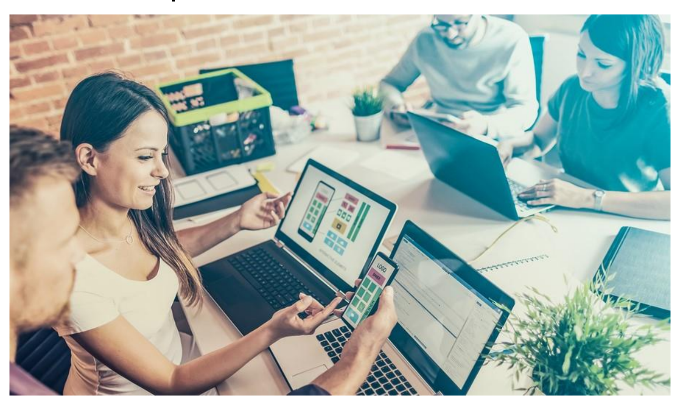
How to increase website traffic tips from Yulin Jin

Bringing users to your website, engaging them while there and converting those visits to sales are all critical components to a solid business strategy in the digital age. Three tried and true methods to increase website traffic include strengthening your content, optimizing for mobile users and tapping into the benefits of pay per click (PPC) advertising.